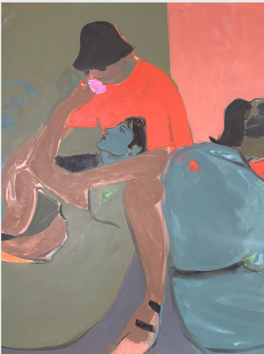
ETERNAL MANDATE OF LOVE, 2023