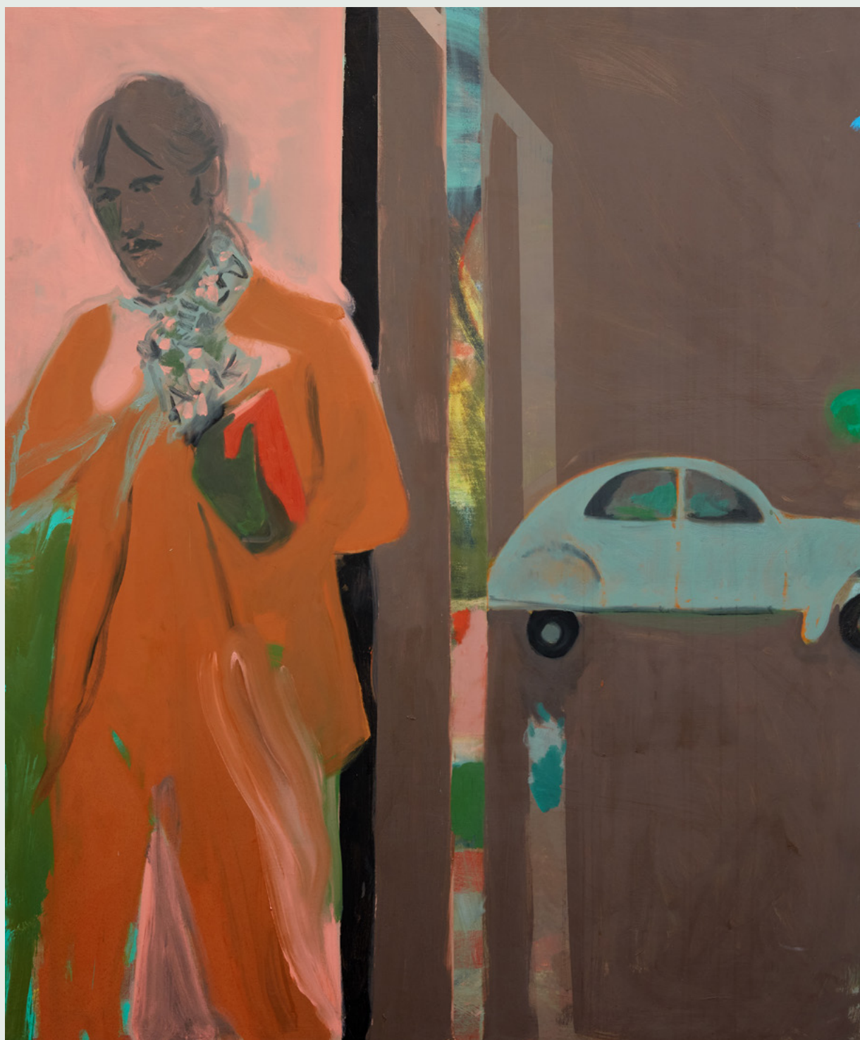
THE SNAIL, 2024 Oil on board, 120 x 100cm