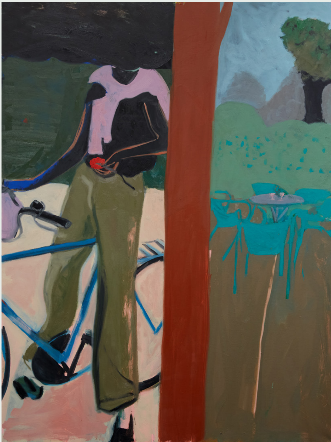
ARBRE ROUGE, 2024 Oil on linen, 165 x 125cm