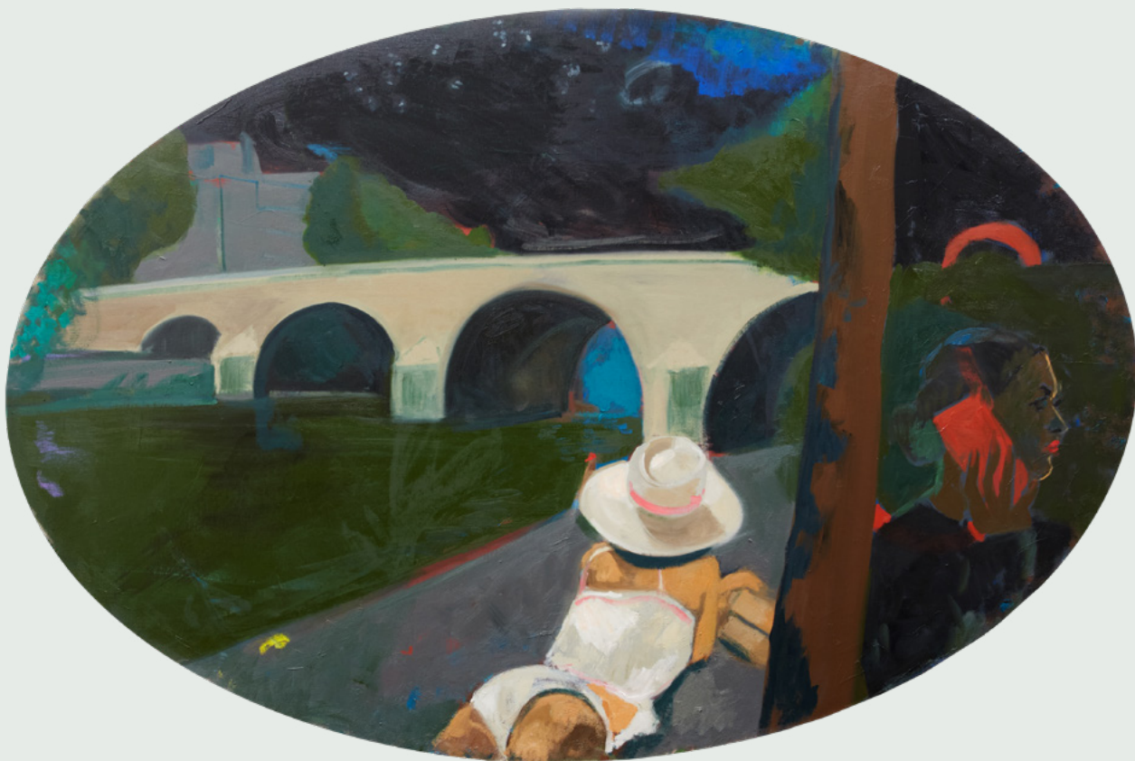
CHAPEAU BLANC (PONT NEUF), 2024 Oil and wax on panel, 180cm diameter