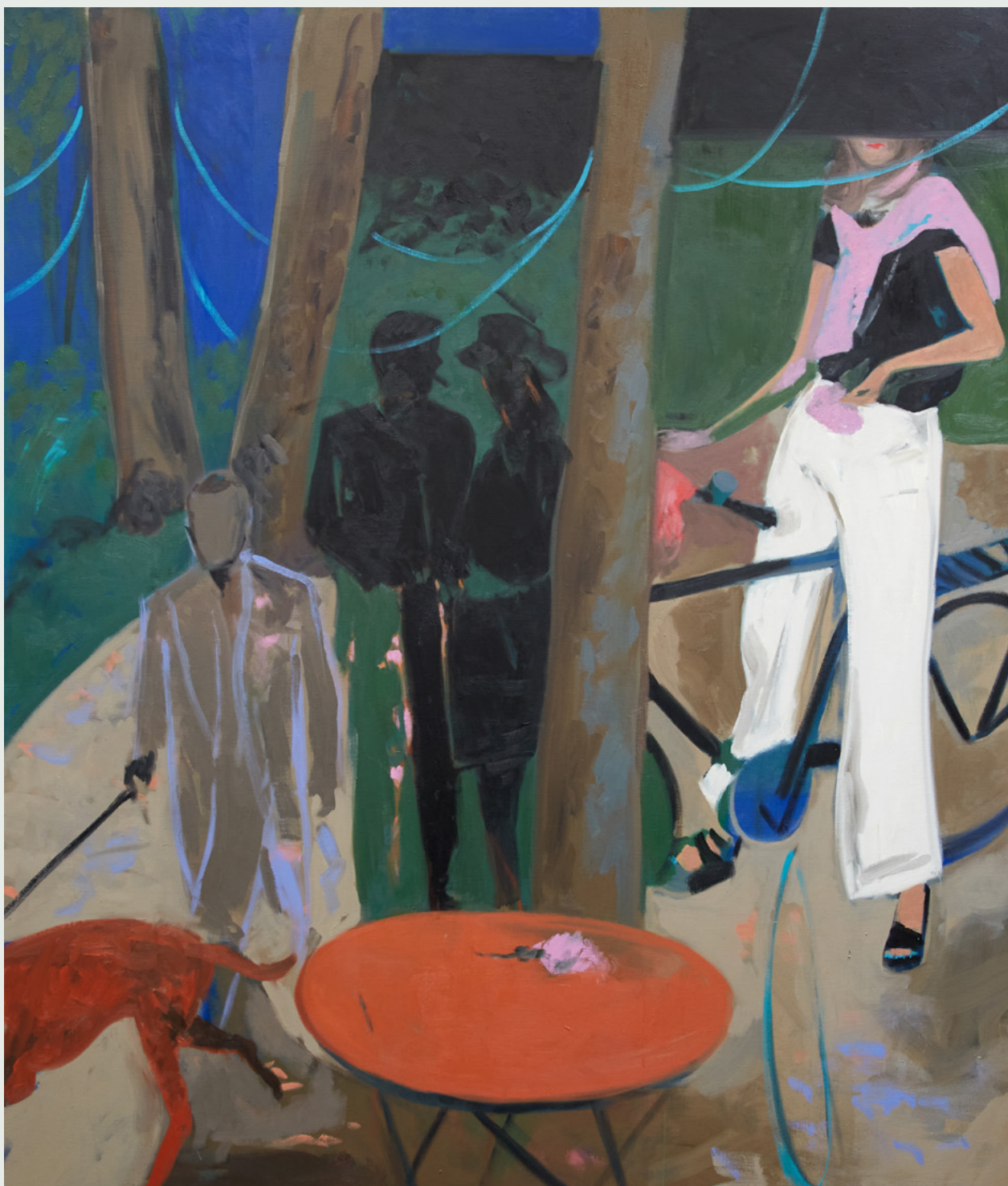
IN THE LUXEMBOURG GARDENS, 2024