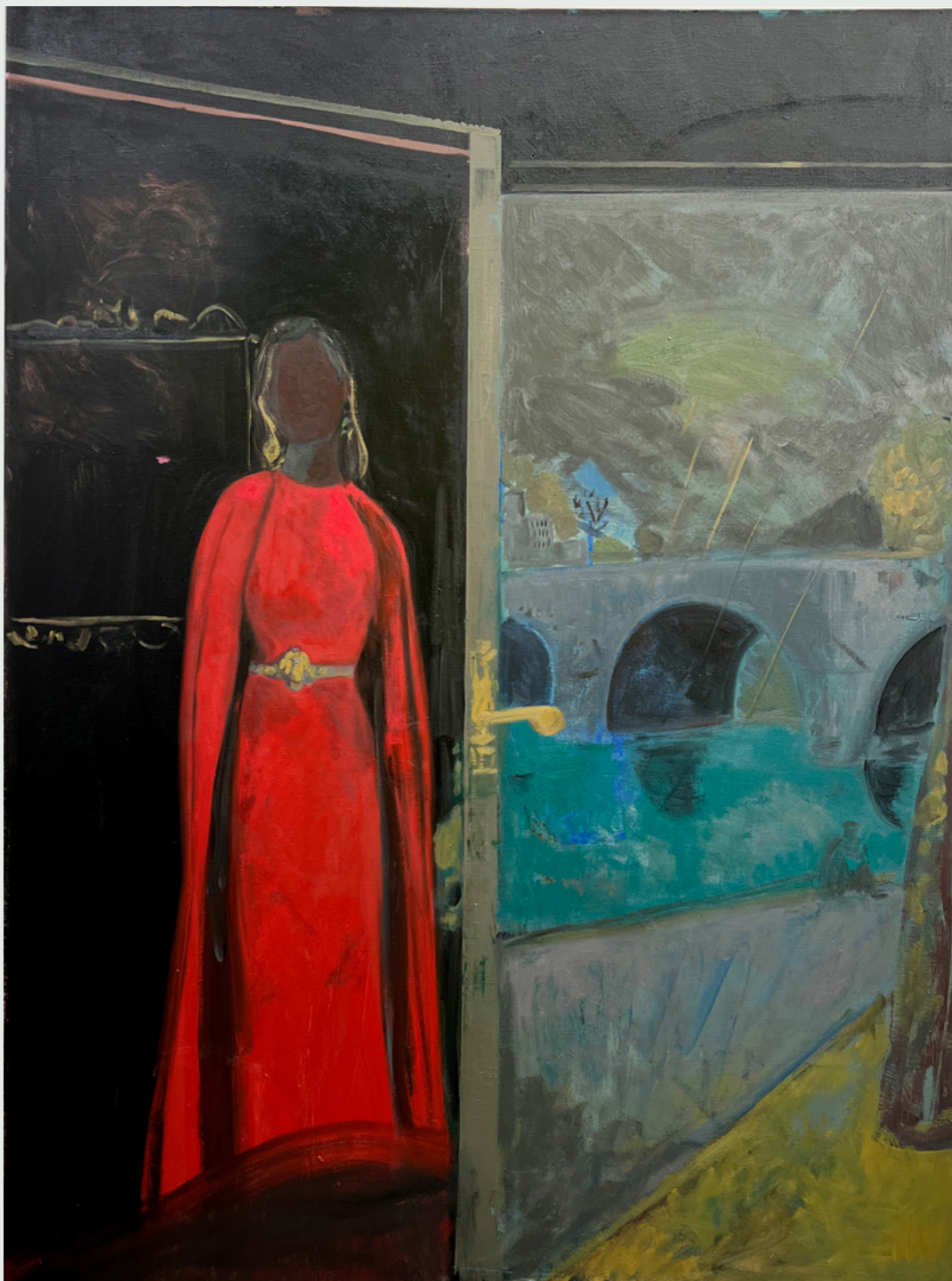
THE BRIDGE, 2024 Oil on linen, 165 x 130cm