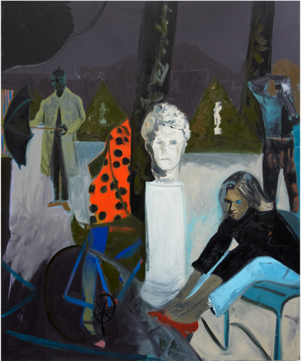
LUX JARDIN I (THE RED SLIPPERS), 2024