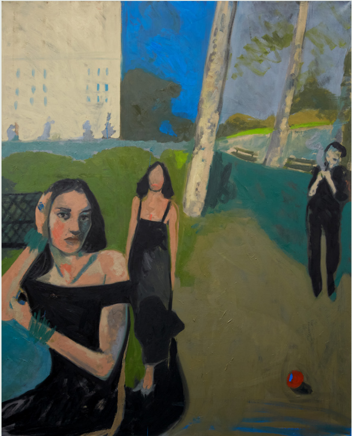
PARIS FRANCE FOR JONI, 2024