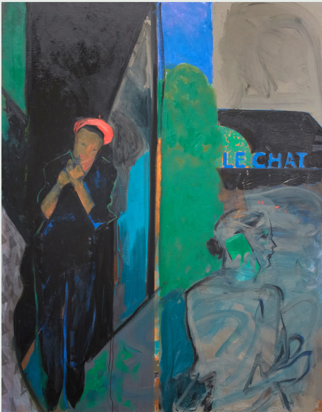
THE DREAMERS LE CHAT, 2024