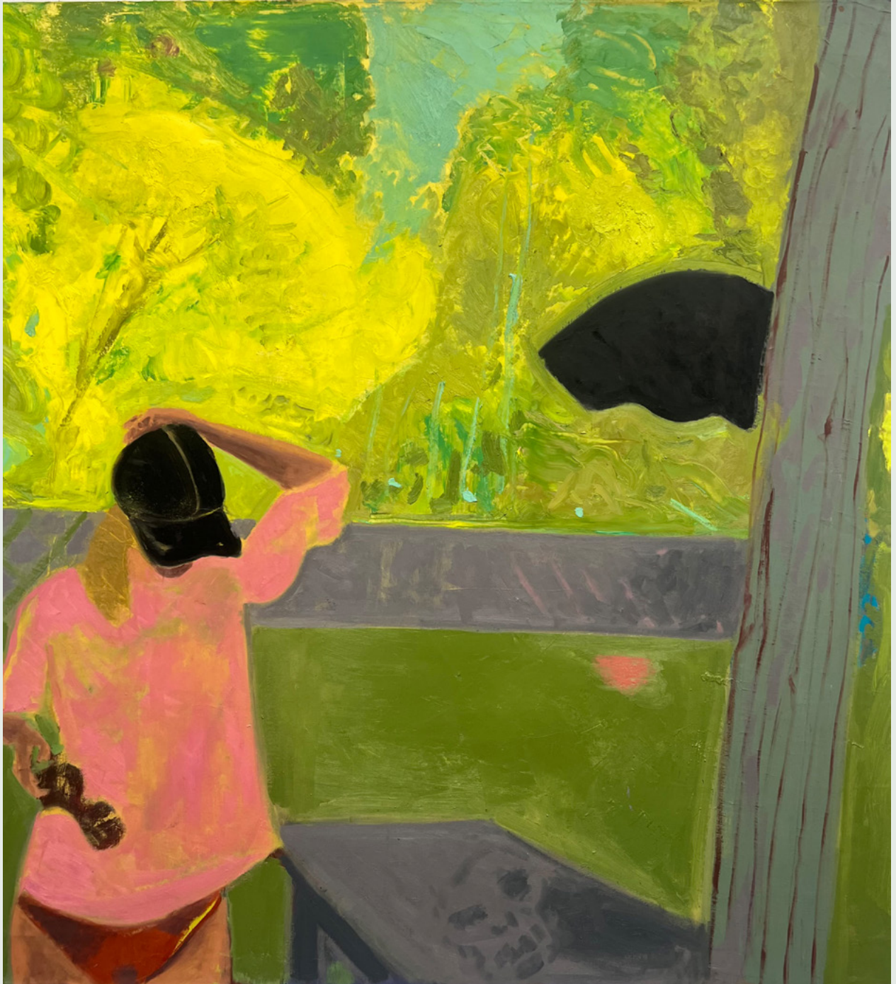
ET ARCADIA EGO, 2024 Oil on linen, 160 x 140cm