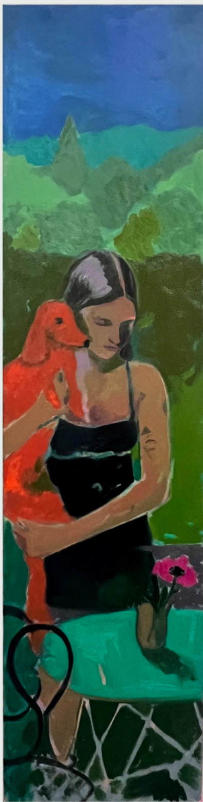
LOOKING AFTER MR B, 2024