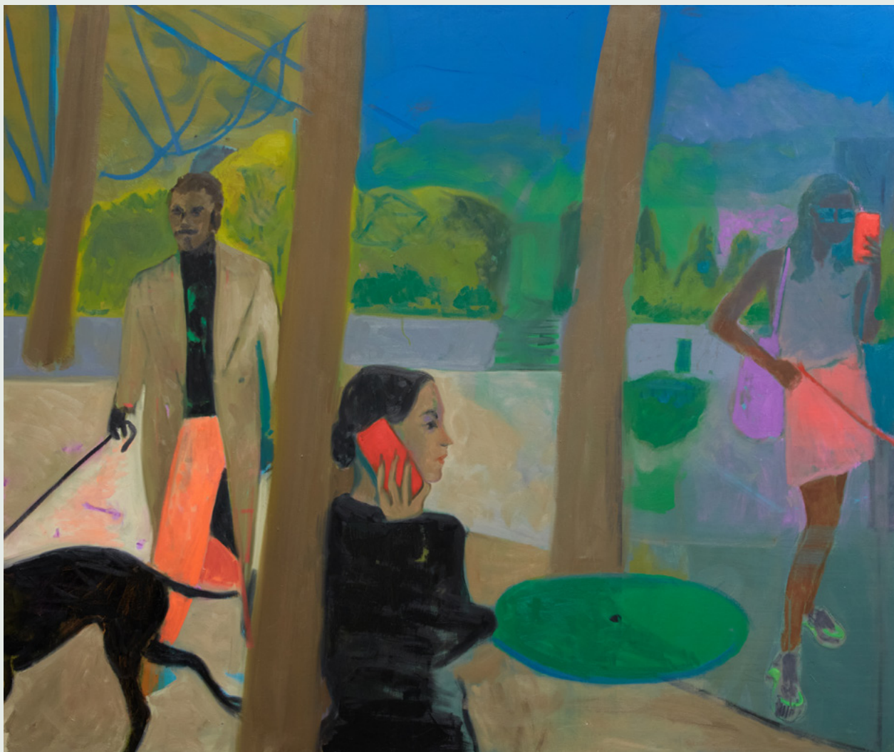
LUX JARDIN II, 2024 Oil on linen, 160 x 190cm