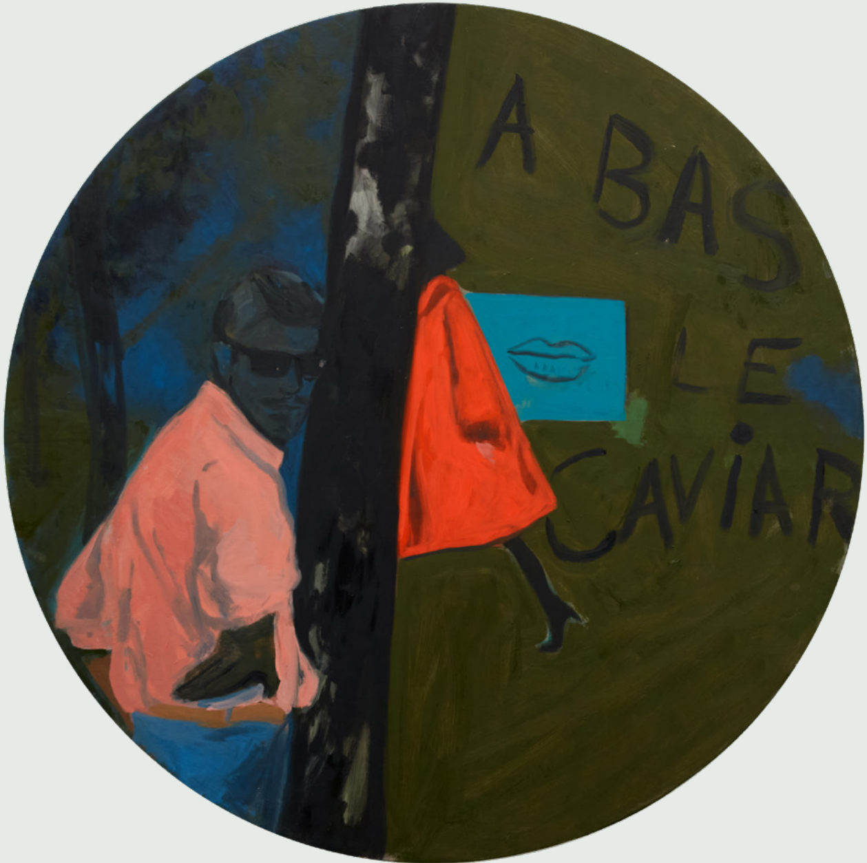
ABAS LE CAVIAR, 2024 Oil on linen, 110cm diameter